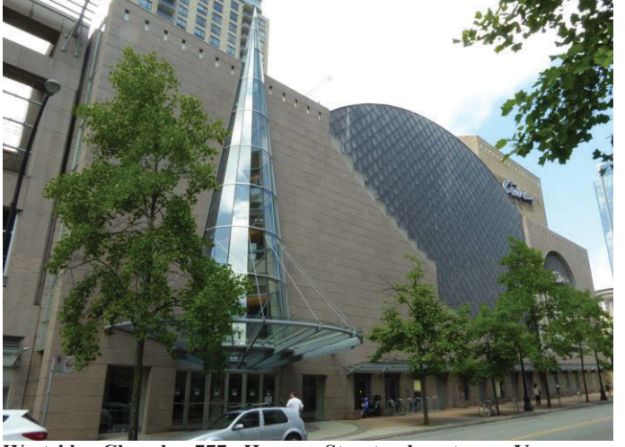
Westside Church, 777 Homer Street, downtown Vancouver, formerly the Centre for the Performing Arts. In 2013, the Mennonite Brethren church plant acquired this property when "The Centre" went up for sale.

2. Education . From the outset, Mennonites have placed a high premium