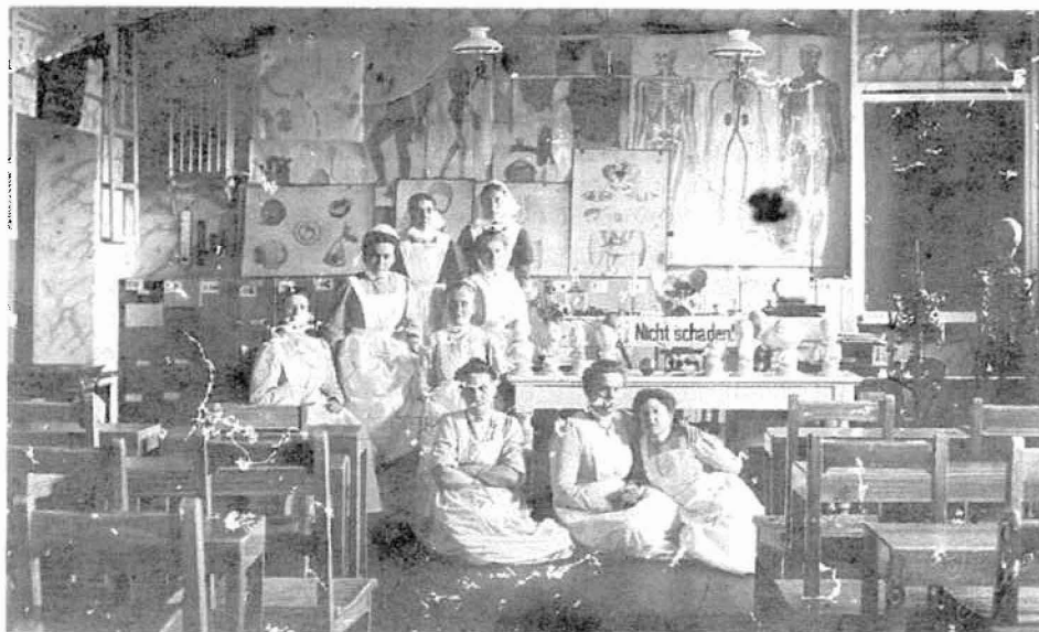
Women in nurses' training, Riga, Latvia, circa 1902.