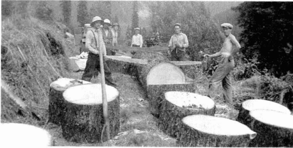
Conscientious objectors felled and cut thousands of trees as one expression of alternative service during the Second World War. This photo was taken at Cave Trail, BC, circa 1943-44. COs also planted trees – 17 million on Vancouver island alone – to revive burnt out forests.

A PUBLICATION OF THE MENNONITE HERITAGE CENTRE and THE CENTRE FOR MB STUDIES IN CANADA