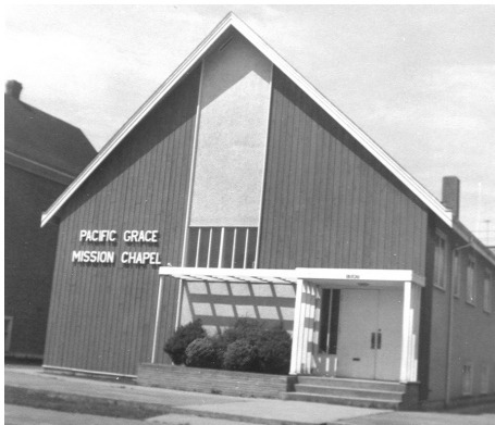
Pacific Grace Mission Chapel / Pacific Grace MB Church