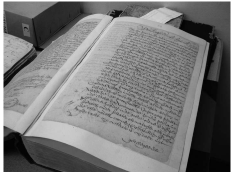
Records in the Western Cape Archives date back to 1651.

This organization is a provincial government archive which also collects non-public records pertaining to the history of the Western Cape and its diverse communities. It was quite amazing to be shown their earliest records of the Cape Colony of Africa dating back to 1651. It would be interesting to compare this collection to our Canadian Hudson Bay Company Archives housed in Manitoba.