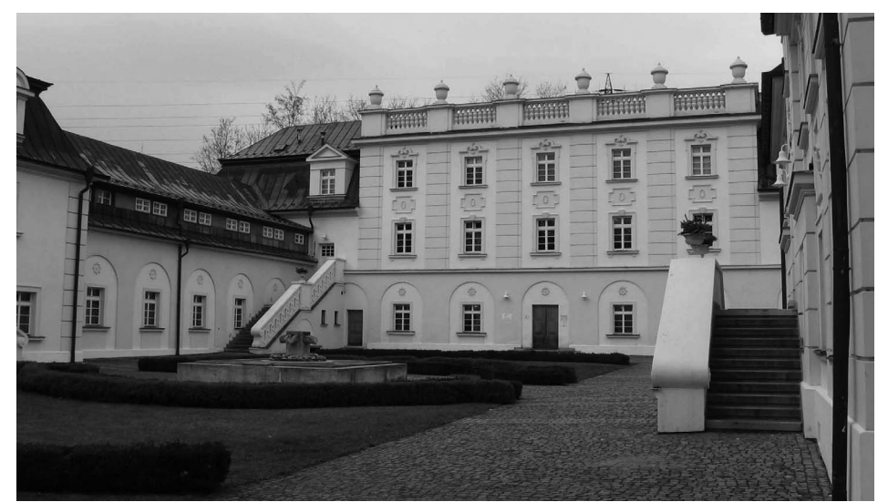
The International Baptist Theological Seminary in Prague.

The vision for IBTS also changed at this time. The primary mission of IBTS is to serve Baptist Unions and seminaries by offering higher degrees in theology that conference would equip leaders. missiologists, and seminary lecturers. In 1998 IBTS became a validated institution of the University of Wales with the right to offer Master of Theology degrees and supervise students working towards a Doctor of Philosophy degree in four areas: Applied Theology, Baptist and Anabaptist Studies, Biblical Studies, and Contextual Missiology. In 2000 the government of the Czech Republic granted IBTS accreditation for a Magister of Theology degree, which is recognized