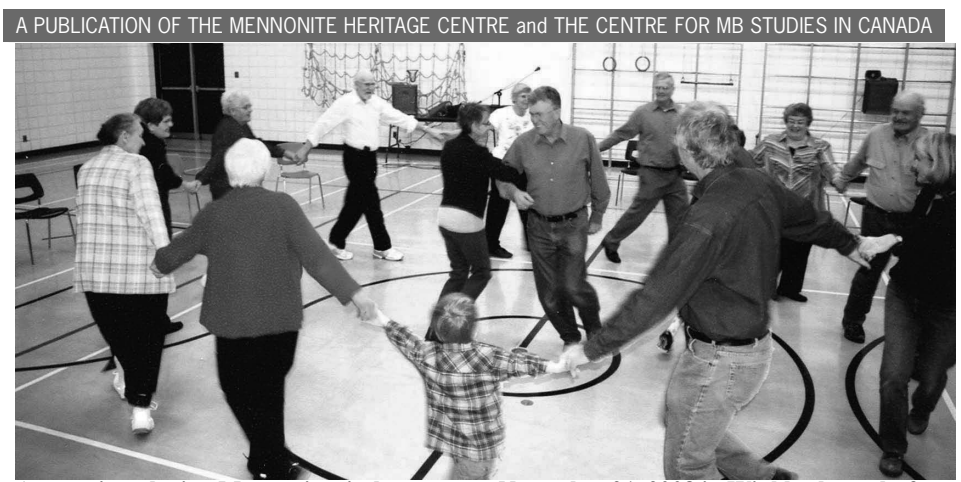
An evening playing Mennonite circle games on November 21, 2008 in Winkler brought fun and laughter to the Manitoba Mennonite Historical Society 50<sup>th</sup> Anniversary Celebration.