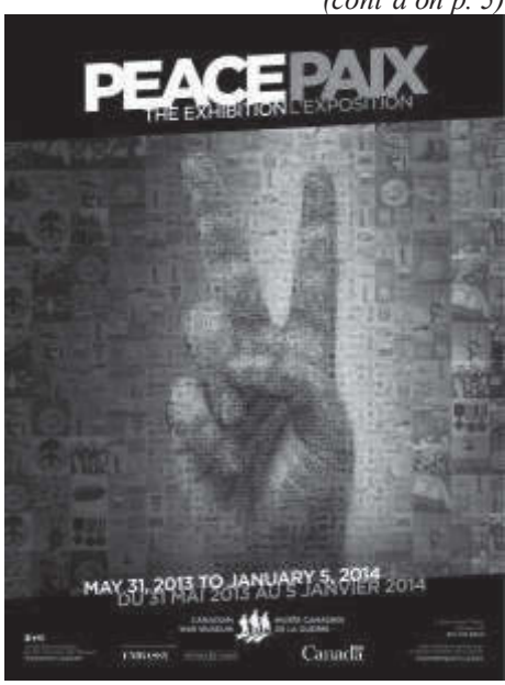
Poster for Peace--The Exhibition