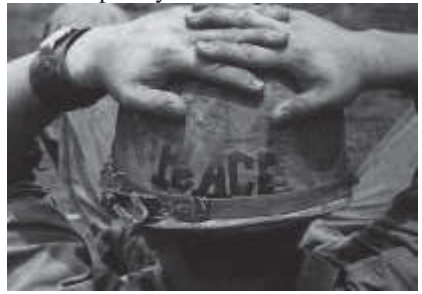
A photo from Peace--The Exhibition . Mennonite Historian September 2013 Page 5

So that leads me to ask, where do we explore some of these other avenues of peacemaking? Where do we highlight peacemaking that inspires creative ideas and methods for addressing conflict? What am I, what are you, doing to promote peace where you are? What would it take to have a Peace Museum with a temporary exhibit on War?