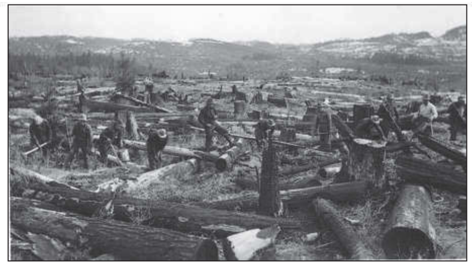
Tree planting on Vancouver Island after fire-damaged trees (snags) have been cut.

A PUBLICATION OF THE MENNONITE HERITAGE CENTRE and THE CENTRE FOR MB STUDIES IN CANADA