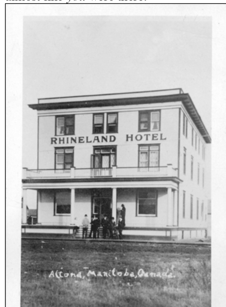
Postcard front.

Postcards provide beautiful snapshots of life around the world at a particular instant in time, from mountains to parades. Many also feature personal notes that share the trivial and the profound, almost like you were there.