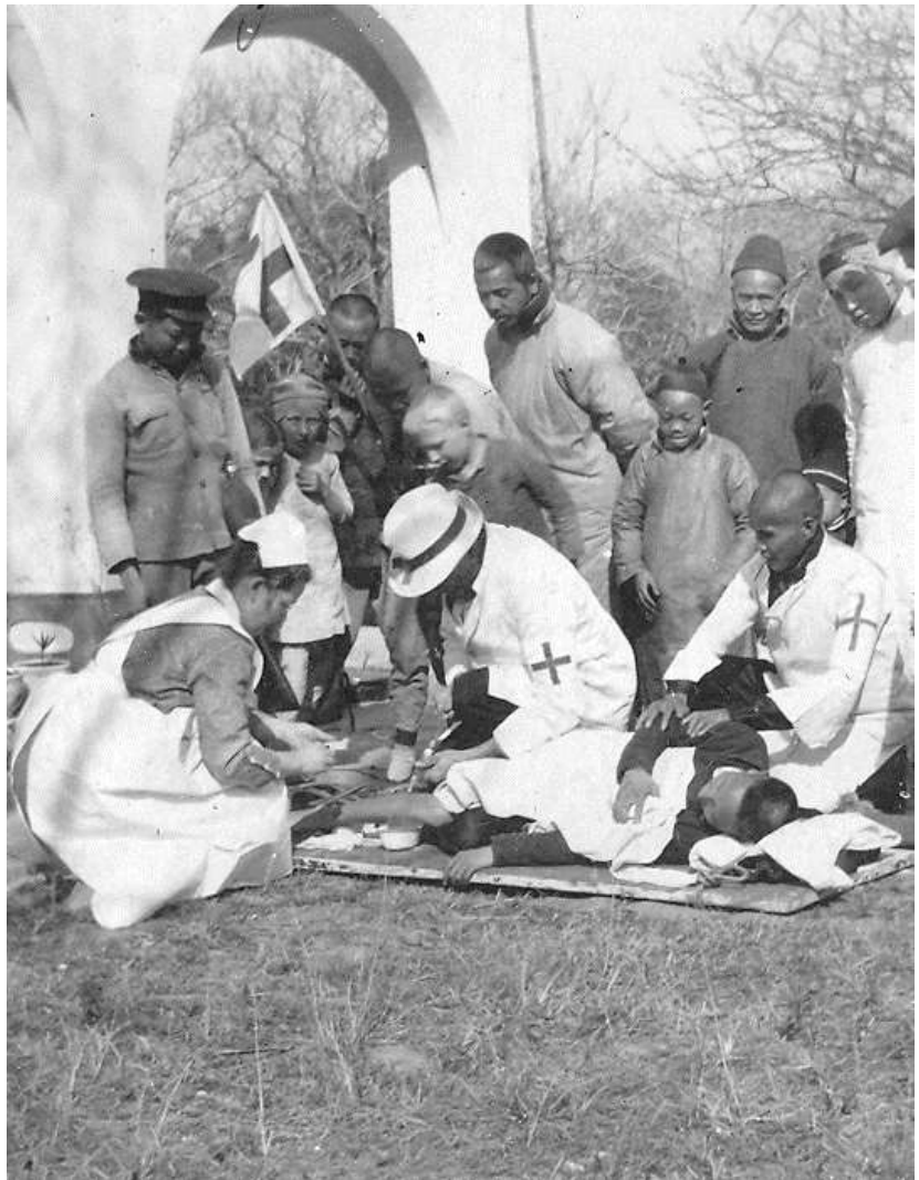
Mennonite missionaries work with Red Cross, helping wounded in China during the "Era of the War Lords," 1916-1923. See story on p. 2.