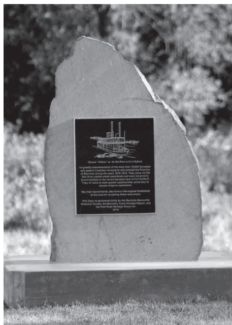
Commemorative cairn at Fort Dufferin marking 140 years since the Mennonite settlers arrived on the Canadian prairies.

The Waisenamt was another Mennonite community institution that had its origins in Prussia and was established to help