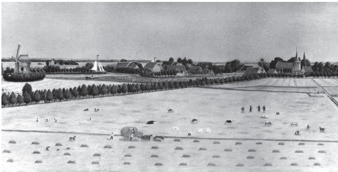
This is a painting by Michael Klaassen (1860–1934) of the area around Tiegenhagen, Prussia, illustrating the flat landscape typical of Mennonite villages with canals, farms, and windmills.

Substitute windmills for grain elevators, a fading old-world architectural icon for its similarly dwindling new-world counterpart, and the terrain reminded